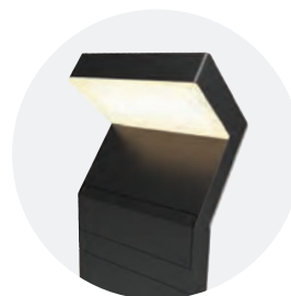
Light distribution from the rear of the bollard