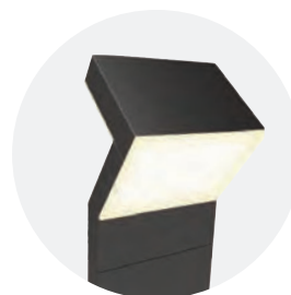
Light distribution from the front of the bollard