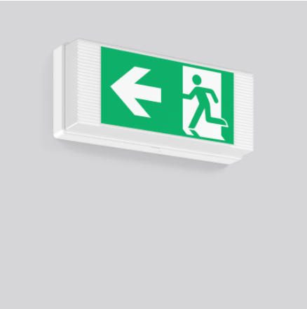
Wall luminaires 4051859991229 L 344, B 144, H 78 Ceiling mounting, Wall (surface) white