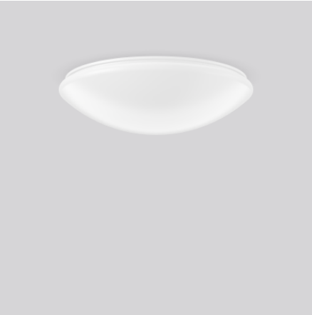
Ceiling and wall luminaires 4051859719663 D 515, H 150 Ceiling mounting, Wall (surface) white