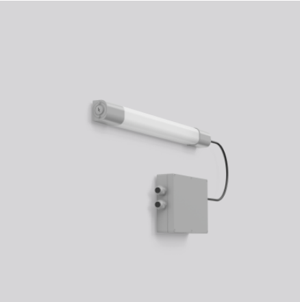
Ceiling and wall luminaires 4051859804727 L 749, B 61, H 50 Ceiling mounting, pendant, Wall (surface) grey