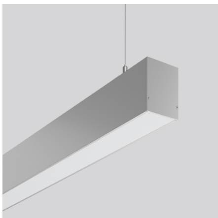
Pendant luminaires 4068754003681 L 847, B 57, H 75