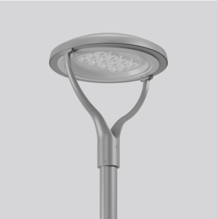
Pole top luminaires 4051859135289 D 500, H 525 Pole mounting silver, matt (approx. RAL 9006)