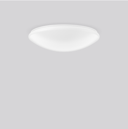
Ceiling and wall luminaires 4051859718802 D 460, H 120 Ceiling mounting, Wall (surface) white