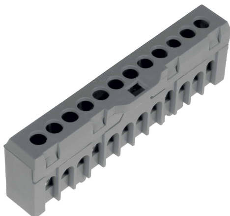
Single-pole terminal block 12x10mm 2 , green