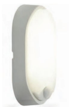
White - PIR