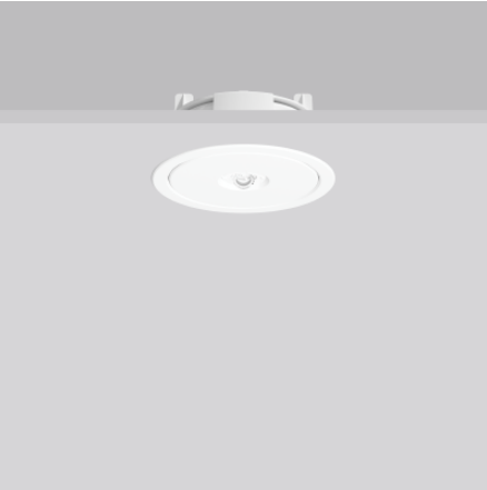
Recessed ceiling luminaires, Ceiling luminaires 4051859721277 D 135, H 2 Ceiling mounting, Recessed ceiling mounting white