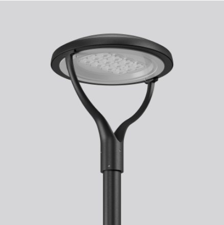
Pole top luminaires 4051859135074 D 500, H 525 Pole mounting anthracite metallic (DB703)