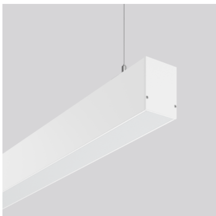
Pendant luminaires 4051859280941 L 1967, B 57, H 75