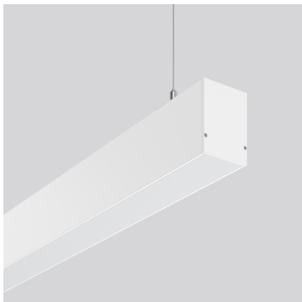
Pendant luminaires 4051859280583 L 1127, B 57, H 75