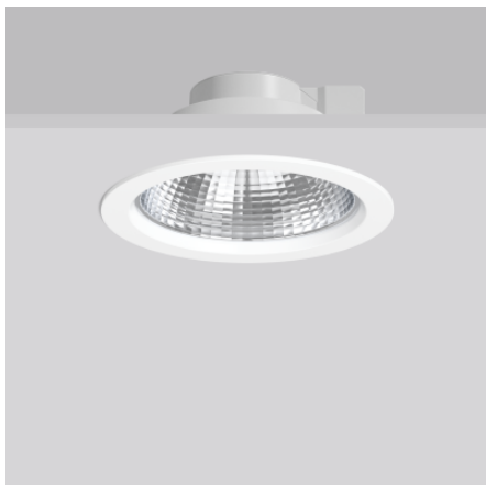
Recessed downlights 4051859165910 D 225, H 4