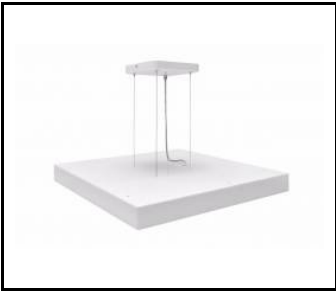
COMPACT LED EVO Z - SYSTEM ZWIESZANIA