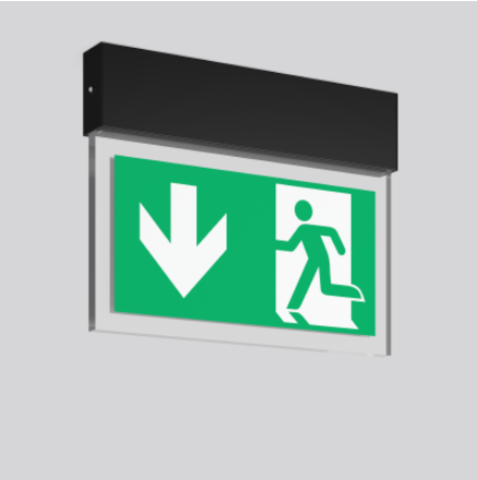
Ceiling luminaires 4051859687955 L 340, B 40, H 270 Ceiling mounting black