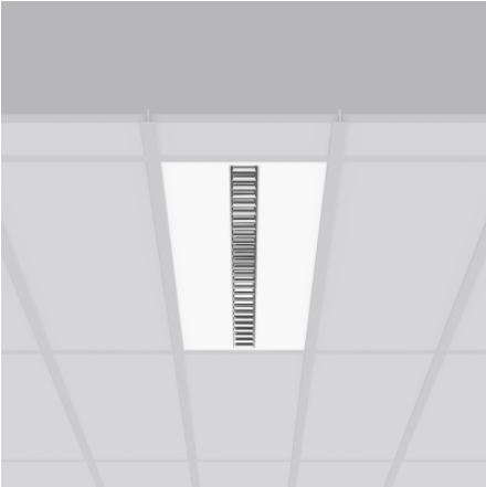
Lay-in luminaires 4051859330882 L 1197, B 297 Recessed ceiling mounting white