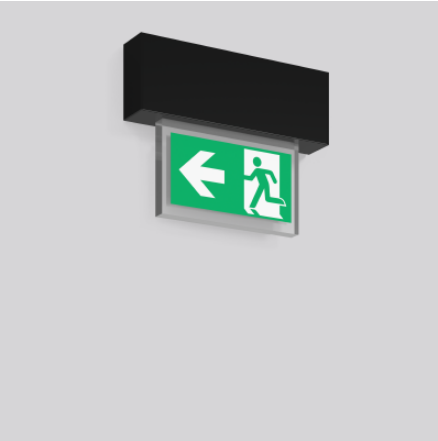
Wall luminaires 4051859687603 L 233, B 44, H 180