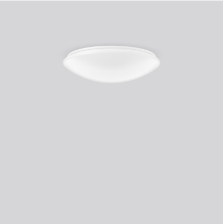
Ceiling and wall luminaires 4051859073017 D 360, H 100 Ceiling mounting, Wall (surface) white