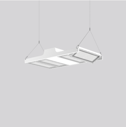
Highbay luminaires 4051859700159 L 680, B 397, H 110 Universal mounting system white