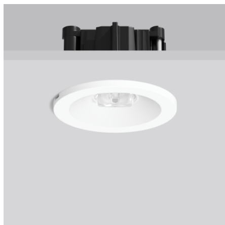
Recessed ceiling luminaires 4051859461951 D 62, H 3