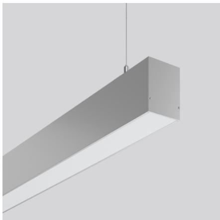
Pendant luminaires 4068754003476 L 847, B 57, H 75