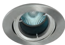
ATL/BA fitted into Twistlock Low glare baffle adaptor