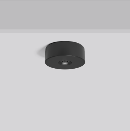
Ceiling luminaires 4051859769644 D 110, H 46 Ceiling mounting black