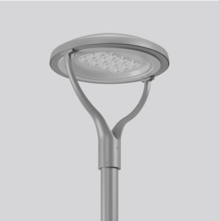
Pole top luminaires 4051859134701 D 500, H 525 Pole mounting silver, matt (approx. RAL 9006)