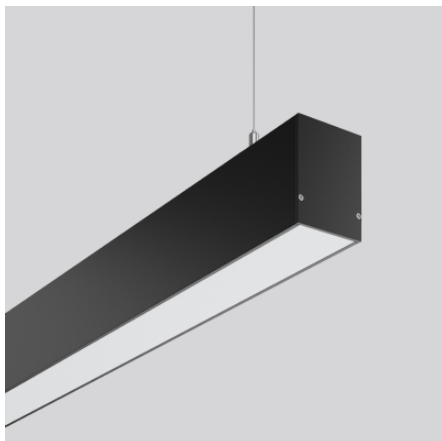
Pendant luminaires 4051859279983 L 1407, B 57, H 75