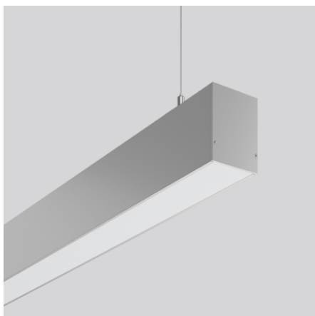
Pendant luminaires 4068754003773 L 1407, B 57, H 75