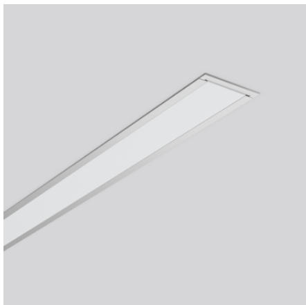
Recessed ceiling and wall luminaires 4068754004015 L 1701, B 71, H 2

Recessed ceiling mounting, wall (recessed) silver, matt (approx. RAL 9006)