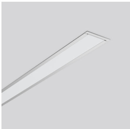
Recessed ceiling and wall luminaires 4068754003971 L 1421, B 71, H 2

Recessed ceiling mounting, wall (recessed) silver, matt (approx. RAL 9006)