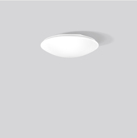
Ceiling and wall luminaires 4051859951155 D 360, H 116 Ceiling mounting, Wall (surface) white