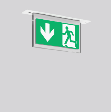
Recessed ceiling luminaires 4051859533221 L 320, B 55, H 140