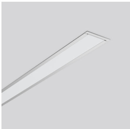
Recessed ceiling and wall luminaires 4068754003957 L 1421, B 71, H 2

Recessed ceiling mounting, wall (recessed) silver, matt (approx. RAL 9006)