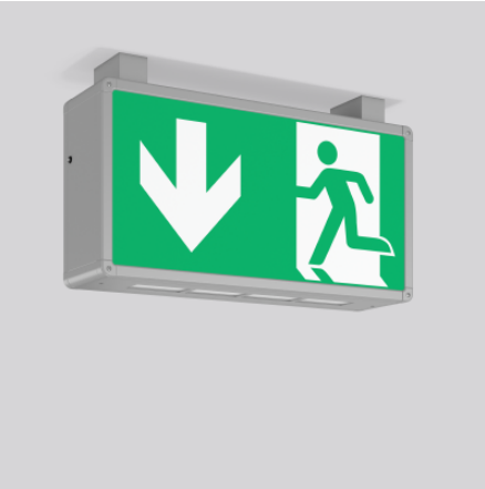
Ceiling luminaires 4051859985594 L 485, B 125, H 250 Ceiling mounting anodised aluminium