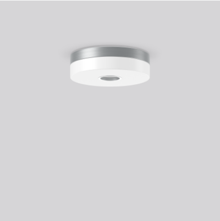
Ceiling and wall luminaires 4051859254966 D 300, H 95 Ceiling mounting, Wall (surface) brushed stainless steel