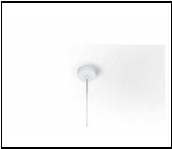
capella led z białą zwiesie

Card creation date: 02 January 2025 The company reserves the right to make design changes or upgrades in the presented product. Product data sheet does not constitute an offer. * Parameter tolerance is +/- 10%