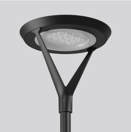
Pole top luminaires 4051859135753 D 650, H 610 Pole mounting anthracite metallic (DB703)