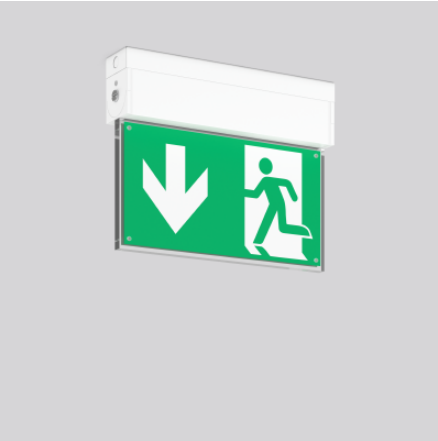
Ceiling and wall luminaires 4051859397120 L 247, B 45, H 195 Ceiling mounting, Wall (surface) white