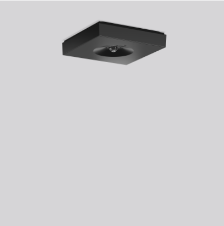
Ceiling luminaires 4051859869245 L 150, B 150, H 30 Ceiling mounting black