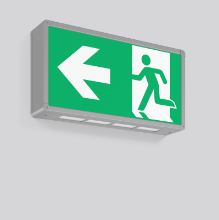
Wall luminaires 4051859985761 L 485, B 90, H 250 Wall (surface) anodised aluminium