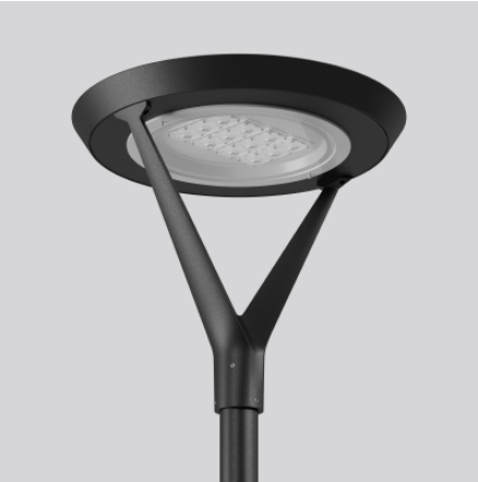
Pole top luminaires 4051859376408 D 650, H 610 Pole mounting anthracite metallic (DB703)