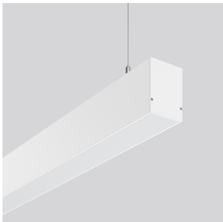
Pendant luminaires 4051859280064 L 1687, B 57, H 75