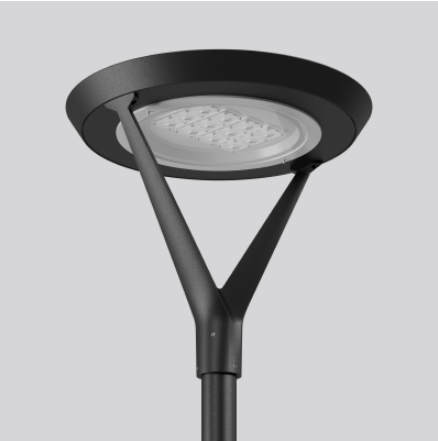
Pole top luminaires 4051859135708 D 650, H 610 Pole mounting anthracite metallic (DB703)