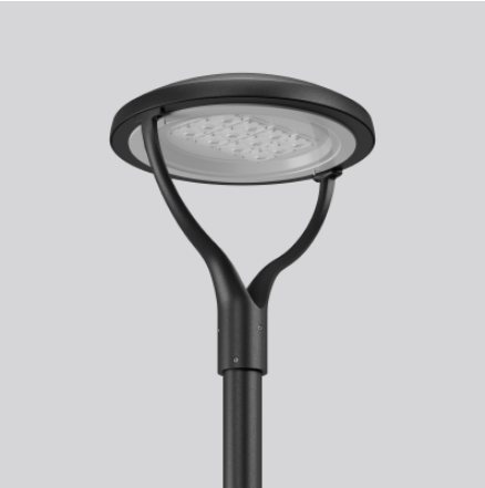
Pole top luminaires 4051859135173 D 500, H 525 Pole mounting anthracite metallic (DB703)