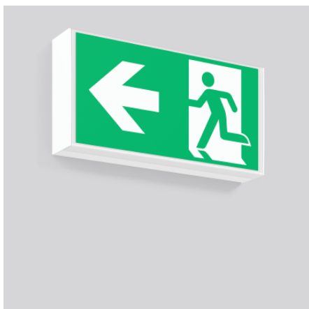
Wall luminaires 4051859928560 L 320, B 160, H 59