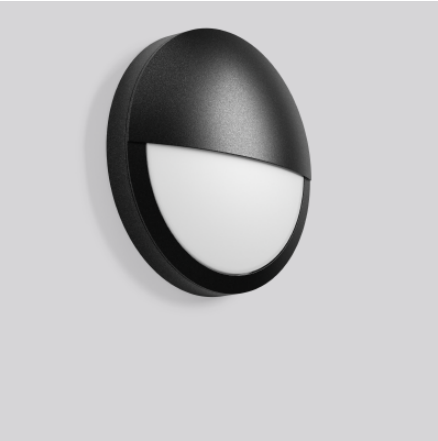
Wall luminaires 4051859774778 D 300, H 77 Wall (surface) anthracite metallic (DB703)